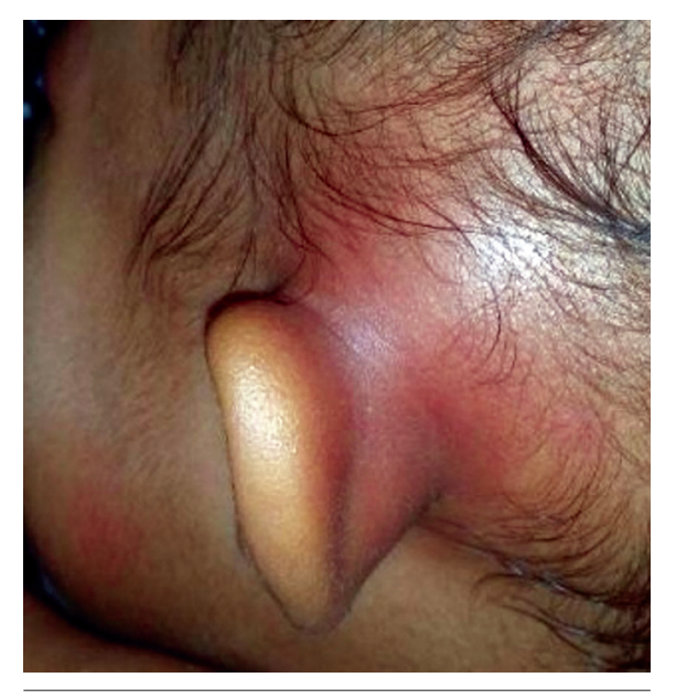
Figure 1: Swelling over the left postauricular region suggestive of acute mastoiditis or mastoid abscess.

a soft tissue mass occupying the mastoid cavity with serous fluid collection. Tissue biopsies taken from the mass, external ear canal, and the hard palate eventually confirmed the diagnosis of LCH with the detection of CD1a and S-100 protein [Figure 3]. Treatment modalities, including chemotherapy, were discussed. Unfortunately, her parents refused further intervention and opted for conservative management. They did not present for follow-up subsequently.